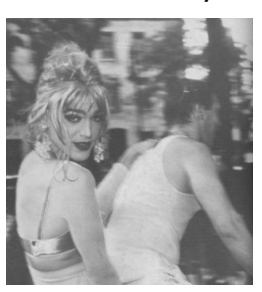
Originally published in